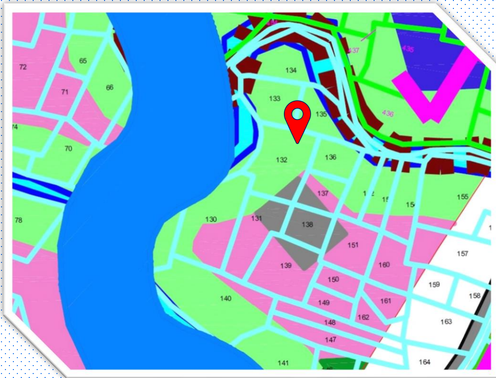
KNOWLEDGE & IT ZONE