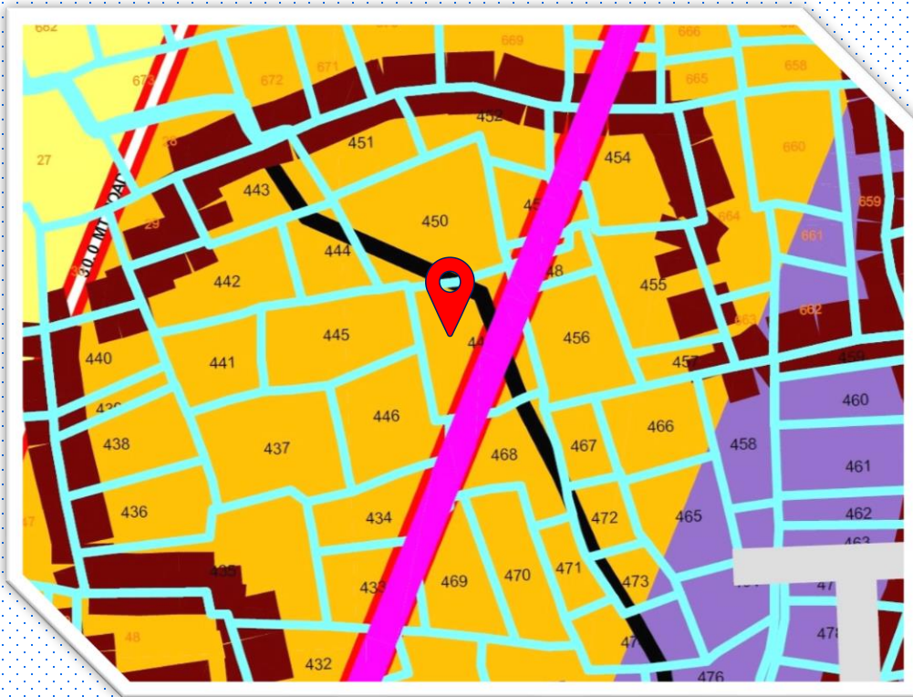
HIGH ACCESS CORRIDOR